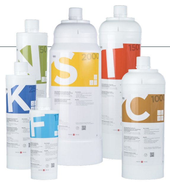
Within the product groups, filters are available in different sizes.

Our six product groups are tailored to a wide variety of applications and can thus provide you with water customized to your individual needs.